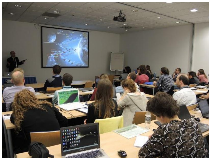
Figure 3 - Introductory NASA lecture on the observation of ecosystem dynamics during TAT 2015.