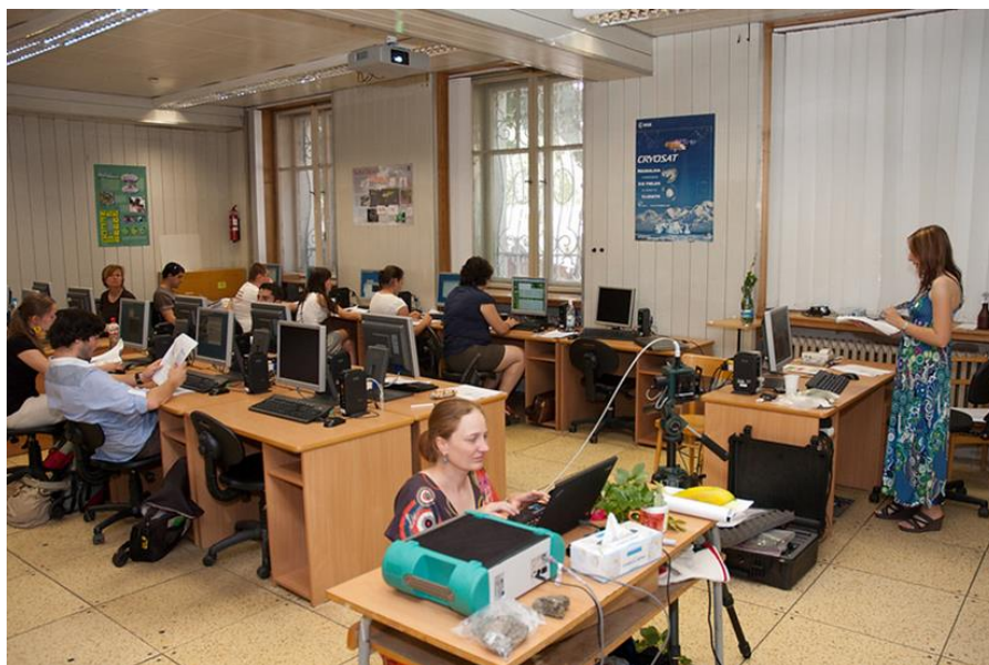
Figure 1 - TAT 2013 hands-on session and spectroscopy experiments.

Thematic presentations and discussions focused on Land Use/Land Cover Change and ecosystems processes. The state-of-the-art advanced methods of land-cover change evaluation were presented and discussed by leading experts from Europe and US. Impact of land use cover change on ecosystems, such as forest disturbance, urban sprawl, and land abandonment were addressed. Additionally, the compatibility and accuracy of the related main databases, such as Corine Land Cover (CLC), GlobCover, National Land Cover Database (NLCD) and Global Land Cover Characterization (GLCC) were discussed. Emphasis was also given to the use of data from Landsat-8 and Sentinel missions.